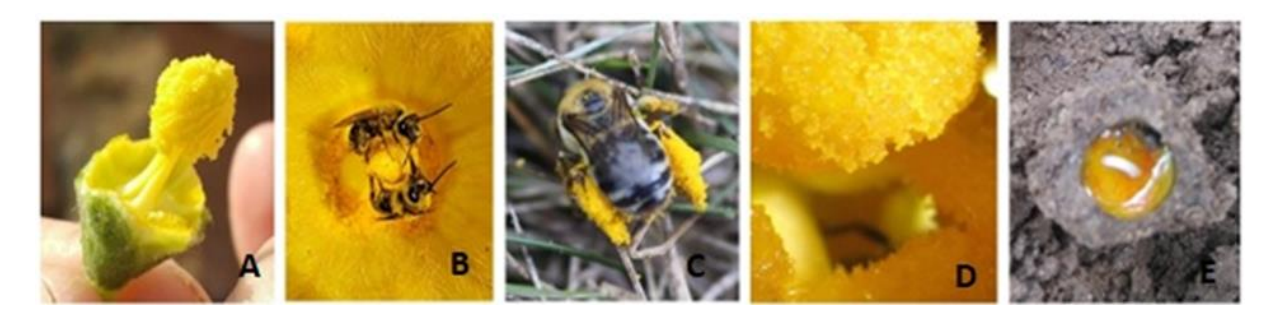
Figure 1. Pollen apportioning in the hoary squash bee-acorn squash pollination system. A: pollen presentation on the synandrium of a staminate flower (available pollen), B: pollen dislodged from the synandrium by the activities of hoary squash bees and wasted at the base of the corolla (waste pollen), C: pollen load on a female hoary squash bee returning to their nest, D: pollen deposited by bees on the stigma of an acorn squash pistillate flower (pollination), and E: pollen deposited into a subterranean nest cell for hoary squash bee larvae (provisions).

The activity of hoary squash bees on staminate acorn squash flowers often dislodges pollen that then falls to the base of the corolla where it collects over the day and is wasted (i.e., it is neither harvested by bees nor available for pollination) (Fig. 1). We collected waste pollen from wilted staminate flowers on August 17 and 23, 2017 (N = 30 flowers). By this point, the synandria of the flowers had been fully stripped of pollen. All waste pollen in the flowers was attributable only to the activities of female hoary squash bees because no bumble or honey bees were present. After carefully removing the stripped synandrium from each flower, the pollen remaining in the base of the corolla was tapped into a small disposable plastic cup and transferred into a 2 mL microcentrifuge tube. Subsequently, 0.5 mL of 70% ethanol and 1.5 mL of 50% glycerin solution were added to the tube. The resulting suspension was mixed and counted using the method described above for synandria of staminate flowers.