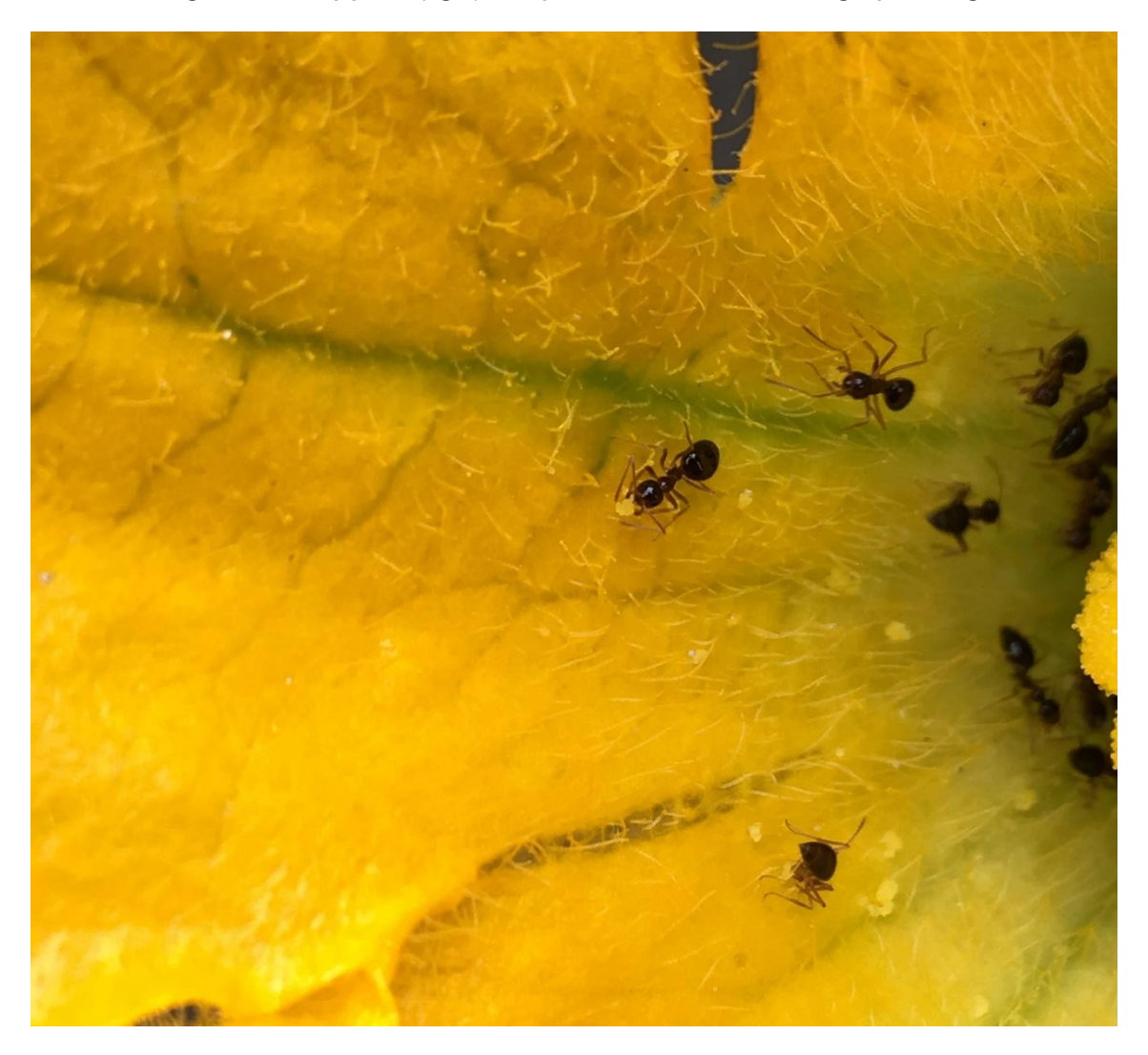
Figure 4. Ants collecting waste pollen grains from a staminate pumpkin flower.