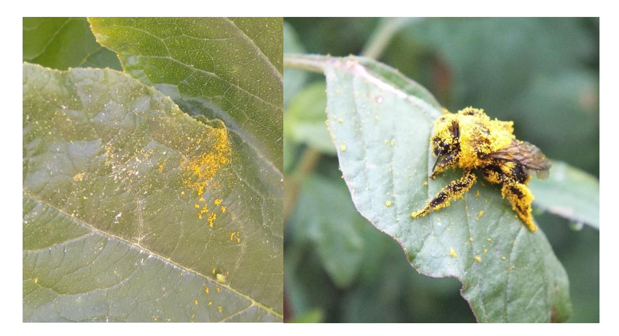
Figure 3. Cucurbita crop pollen discarded by a honey bee (Apis mellifera) on a leaf (left) and a bumble bee (Bombus impatiens) in the process of discarding Cucurbita crop pollen (right).