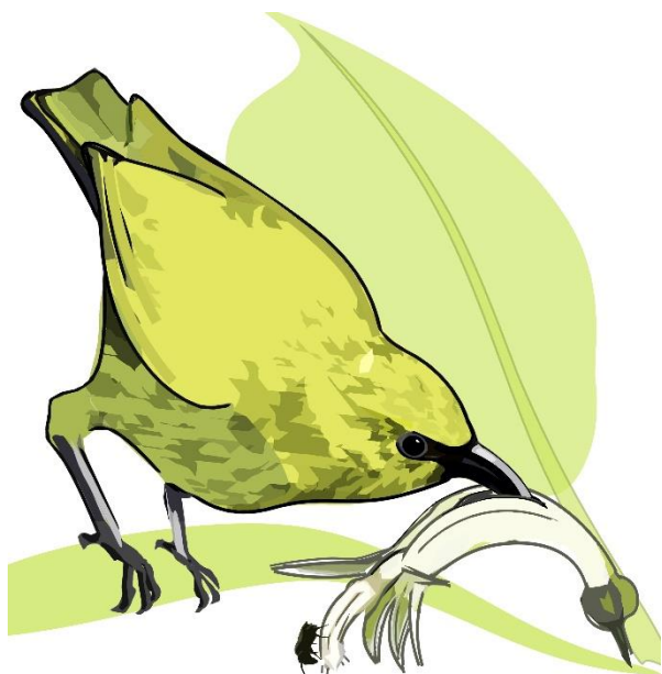
Figure 1. Illustration of a Delissea waianaensis flower with nectar larceny by O'ahu 'amakihi ( Chlorodrepanis flava ) and contacting pollen by yellow-faced bees ( Hylaeus sp.).

conspecific flowers in the neighbourhood (Fig. 2C-D). In contrast, a greater number of heterospecific flowers in the neighbourhood decreased the number of visits, although effects were marginal (Tab. 4, Fig. 2E). Lastly, we found that increased canopy cover increased the number of visits by birds (Tab. 4, Fig. 2F).