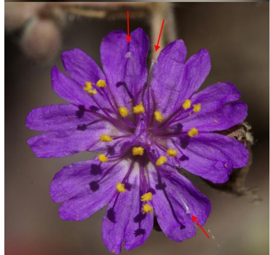
FIGURE 1. Photographs of Allionia incarnata L. (A) and (B) represent left- and right-handed blossoms, respectively. Each Allionia blossom consists of three zygomorphic flowers, each with an enantiomorphic style. Arrows point to styles, which are deflected either to the left or to the right. However, all three styles are generally not deflected in the same direction, resulting in two parallel styles and the third style pointing away from the other two. Styles are white tipped, making pollen visible with the naked eye as seen on the top-left style in (A).

on the wing. The most common visitors were identified at least to genus. We observed floral landing positions for the two most frequent visitor species ( Hemiargus ceraunus (Lepidoptera, Lycaenidae), Halictus sp. (Hymenoptera, Halictidae)), noting whether the visitor landed on the top, bottom, left, right, or middle of the blossom (Fig. 2C). The observer stood < 1 m from the blossoms, to ensure careful observation of visitor behavior. To determine whether the two most common visitors were likely to contribute to intra-floral self-pollination or not, we recorded the order in which visitors made contact with Allionia anthers or stigmas. Floral visits in which visitors contacted (touched with any part of their body) only anthers, only stigmas, or stigmas before anthers were classified as “flower-level outcrossing”; visits in which visitors contacted anthers and then stigmas were classified as “flower-