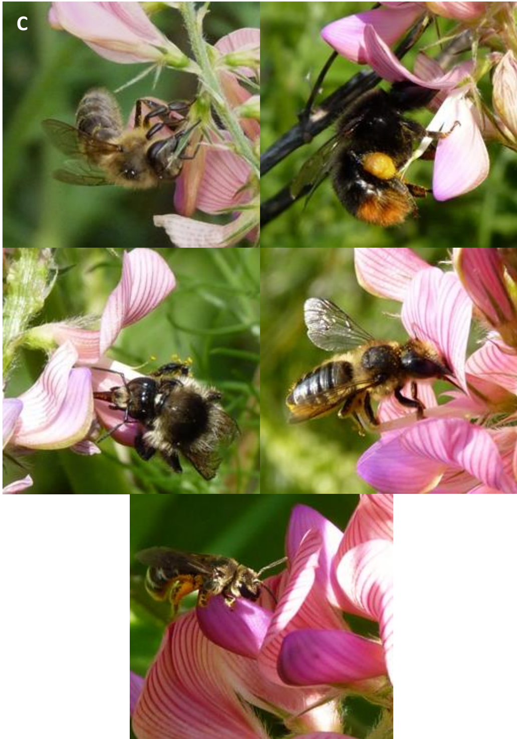
(C) Flower-visitor groups of O. viciifolia (from left to right and top to bottom): Apis mellifera , Bombus lapidarius complex, Bombus sylvarum , Megachile , Halictidae.