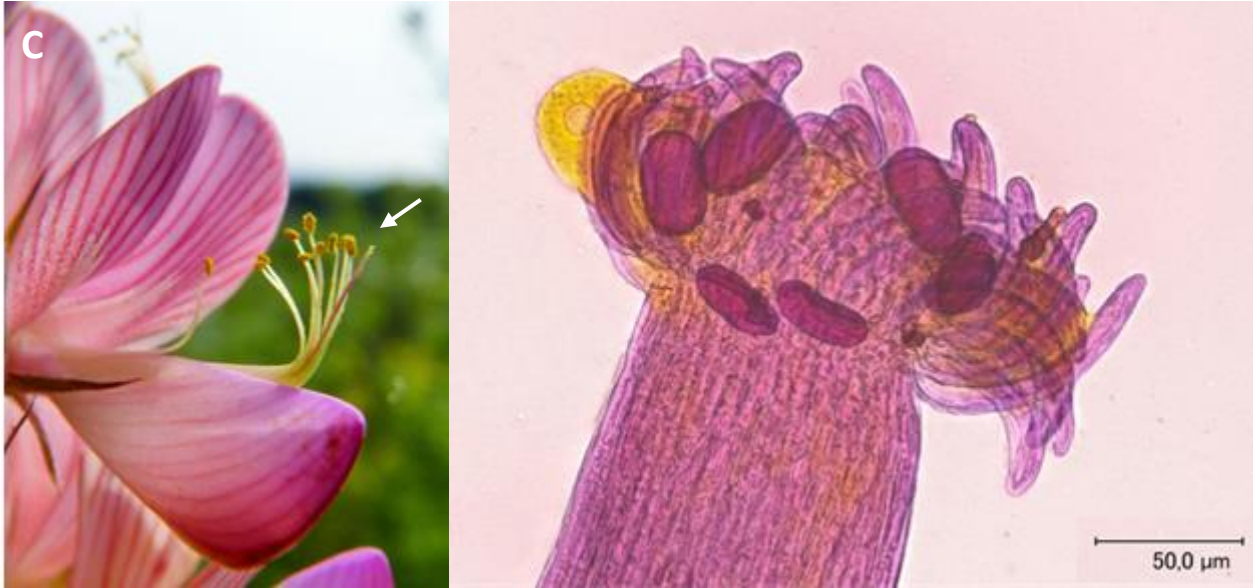
(C) Flower with developed stigma (arrow, left) and stigma of O. viciifolia with conspecific pollen grains (right).