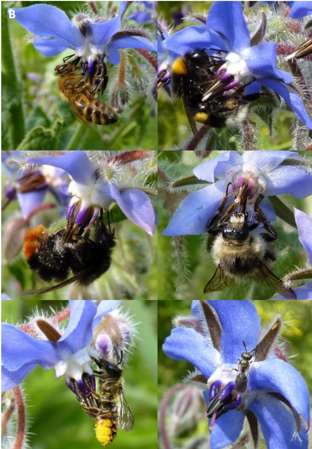
(B) Flower-visitor groups of B. officinalis (from left to right and top to bottom): Apis mellifera , Bombus terrestris complex, Bombus lapidarius complex, Bombus sylvarum , Megachile , Halictidae.