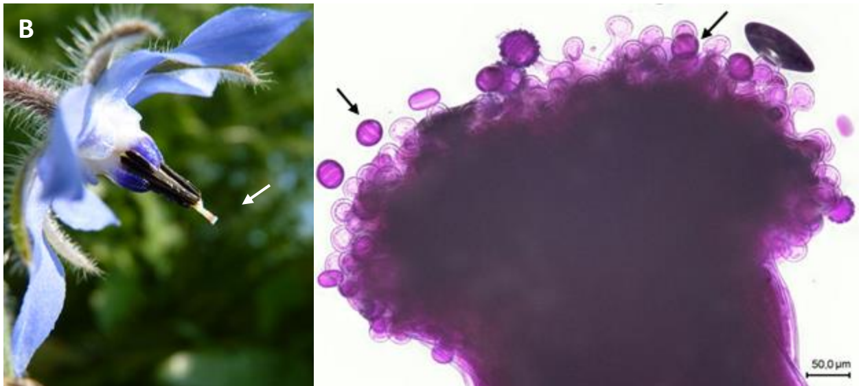
(B) Flower with developed stigma (arrow, left) and stigma of B. officinalis with conspecific pollen grains (arrows, right).