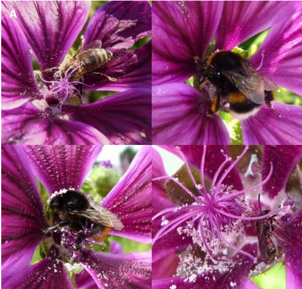
(A) Flower-visitor groups of M. sylvestris (from left to right and top to bottom): Apis mellifera , Bombus terrestris complex, Bombus lapidarius complex, Halictidae.

Appendix II. Exemplary photographs of the analysed flower-visitor groups of (A) M. sylvestris , (B) B. officinalis and (C) O. viciifolia , exceeding mean number of pollen grains on unvisited stigmas.