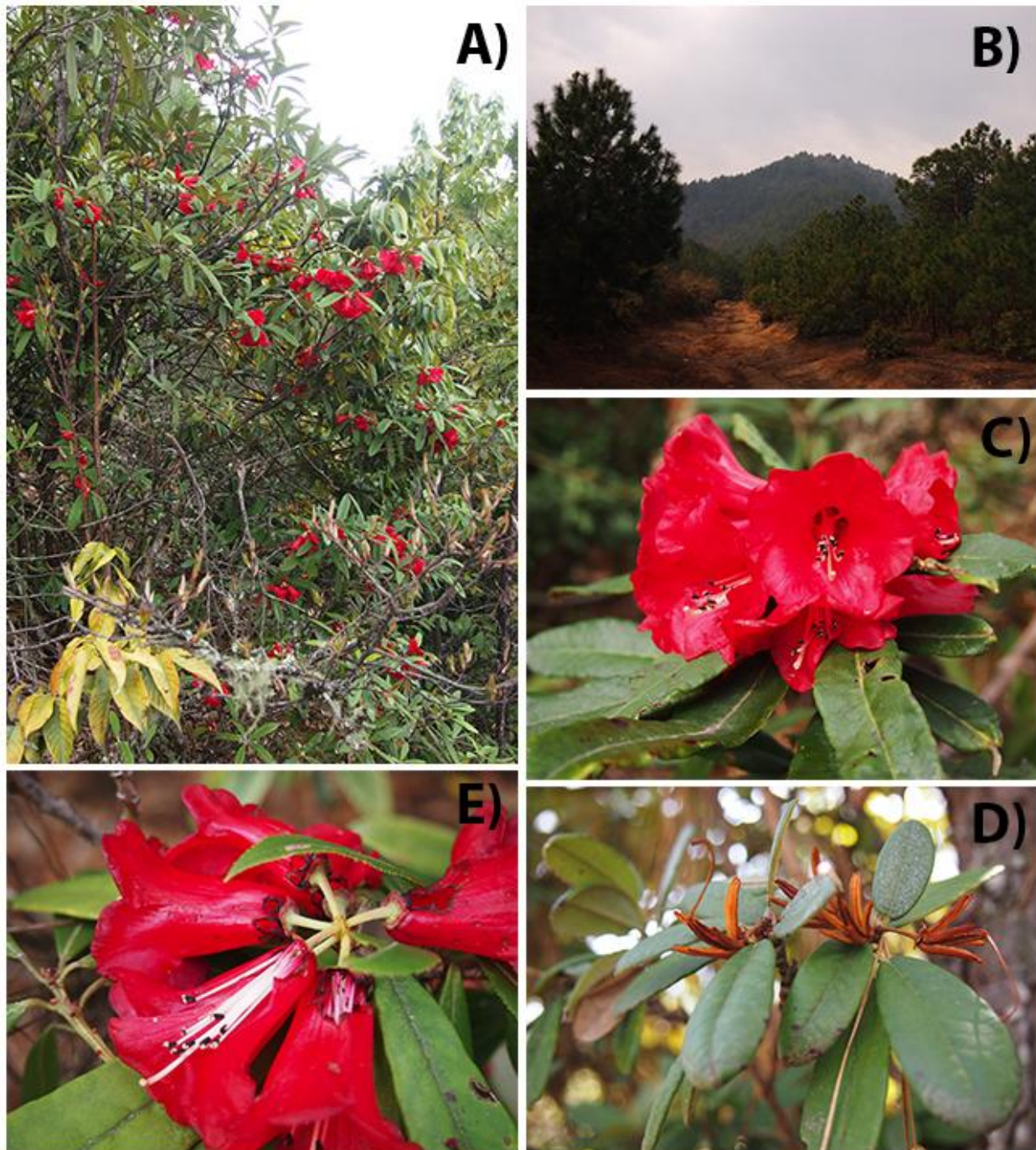
FIGURE 1: A compilation of photographs taken by E.G. in 2012 of R. floccigerum in Weixi: (A) shrub in bloom, (B) R. floccigerum habitat, (C) an inflorescence, (D) last year's capsules, and (E) evidence of robbing, note the holes at the base of the corolla over the nectaries.

basal nectar pouches, and ten stamen, and it flowers between May and June (Wu et al. 2005). The corollas are with or without a darker red basal blotch, or nectar guides (smaller spots that typically lead to a source of nectar), and the flowers are organized in pendant umbels of four to eight flowers, which often fall below the leaves (Fig. 1). The calyx of R. floccigerum is minute, just one to four mm long. It is unknown whether or not R. floccigerum is self-compatible. The floral morphology of R. floccigerum suggests that it is pollinated by birds.