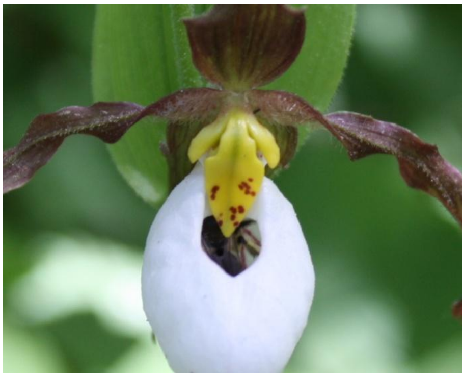
Figure 2. Unidentified bee inside inflated labellum. Note that the bee's head is not visible as it is obscured by the staminode.