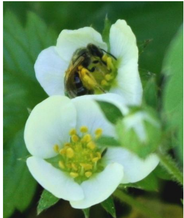
Figure 5. Unidentified bee foraging in flower of F. vesca after it exited a flower of C. montanum approximately two meters away. Note the smear on the dorsum of the thorax.

Of the potential pollinators the majority carried the pollen of at least one other co-blooming taxon that offered floral nectar and/or granular pollen (Tables 2-4; Fig. 5); 0.75 (BMEO, 2003), 0.93 (BMEO, 2004) and 1.0 (ECCO, 2006). Pooling results at BMEO in 2003 and 2004 we noted that >0.62 ( N = 53 ) of the bees visited the pollen and/or nectar secreting taxa of at least one member of the Family, Rosaceae ( Fragaria vesca var. bracteata , Physocarpus capitatus , Potentilla glandulosa , Rosa sp., Rubus parviflorus ) and Smilacina stellata (Asparagaceae) before they began visiting flowers of C. montanum . On 5/25/04 we observed a Lasioglossum -sized bee foraging on flowers of S. stellata over a 20-minute period. It interrupted foraging on this species four times to land on labella of adjacent flowers of C. montanum but it never entered the labellum. In contrast, pollen load analyses of C. montanum collected at the ECCO site indicated that >0.74 of the potential pollinators to C. montanum also visited the flowers of the nectar-secreting shrub, Ceanothus velutinus (Rhamnaceae; Tab. 5).