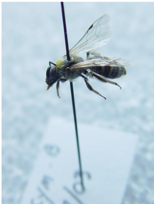
Figure 4. Pinned specimen of Lasioglossum sp (collected in 2003) wearing the entire contents of an anther cell on the dorsum of its thorax (Photograph by Andrew Huber).

6/15/2003, we commonly observed two bees in the same labellum at the same time. In all cases of “double” visits observed, the two bees exited the flower via the rear, basal openings. However, these bees left one-by-one as the escape path under the stigma did not appear to accommodate two bees at the same time.