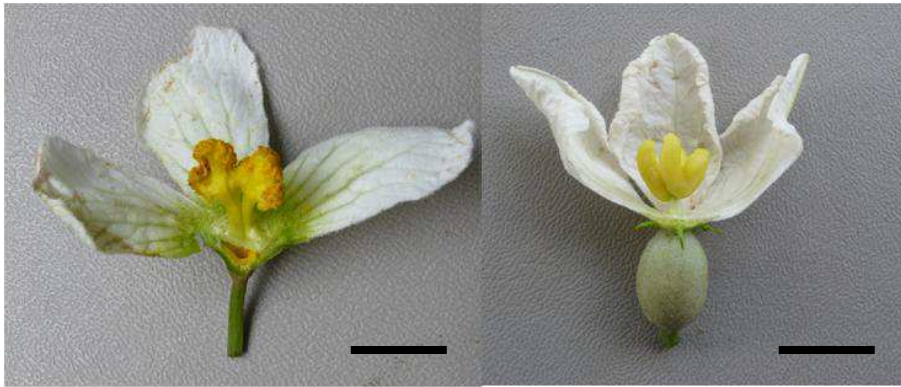
FIGURE 2 – Male (left – scale bar = 15 mm) and female (right – scale bar = 25 mm) flowers of Lagenaria sphaerica (Cucurbitaceae). Note the nectar chamber formed by the filament bases in male flowers; this is absent in the rewardless female flowers.